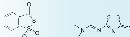
Sulfurizing Reagent (Beaucage) (1) Sulfurizing Reagent II (DDTT) (2)